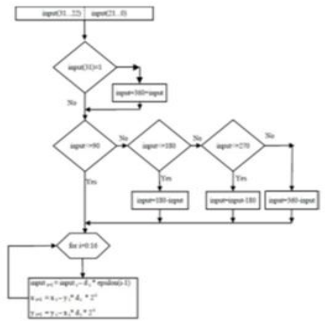
Fig 5. The flow chart of the implementation of a CORDIC algorithm on FPGA using IQ-Math number format

To begin with, the plot is checked whether the value is positive. At that point, it is determined to which region the angle belongs in the x-y plane. Angle value is scrolled to the region I or region II, III or IV. At last, the angle value is compared with epsilon values in the lookup tables. As a consequence of the correlation, the coordinate estimations of the angle are gotten. The coordinate values are acquired by the formula given below: